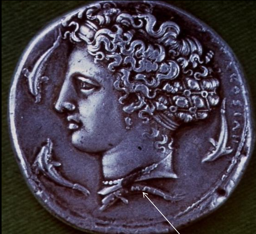
A Dekadrachm of Syracuse, circa 400 B.C. The work of ancient engraver Kimon