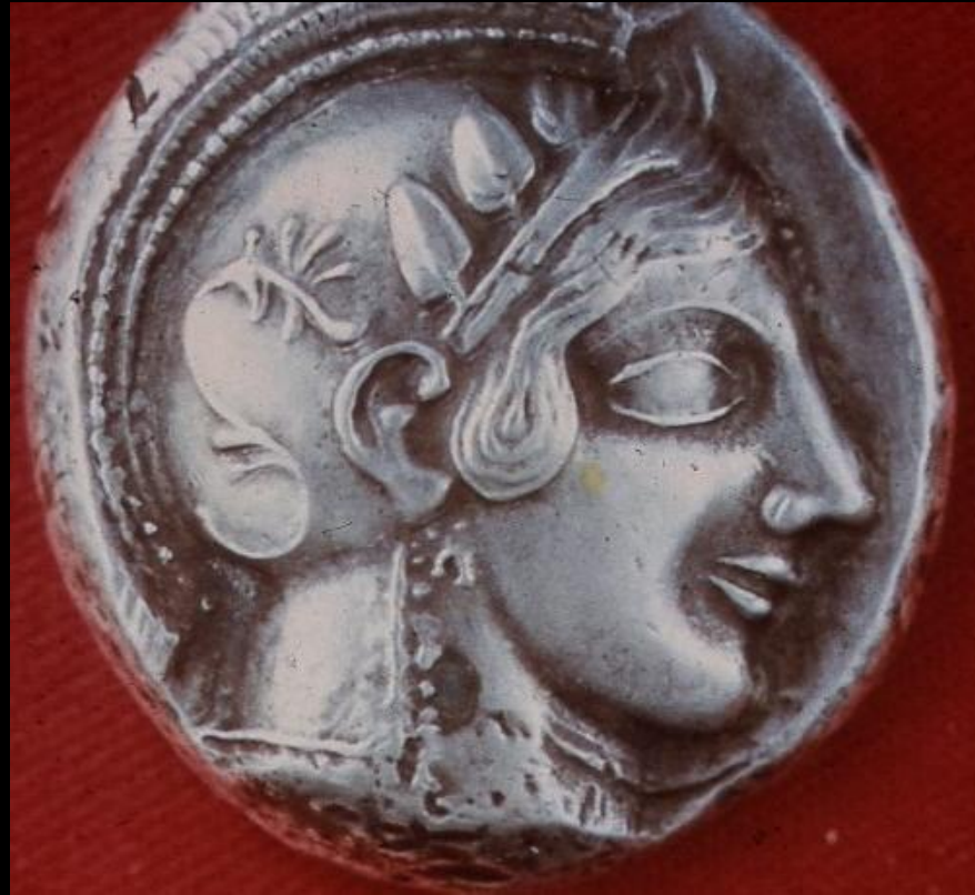
A Dekadrachm (10 Drachms) Athena was the guardian deity of ancient Athens, Greece